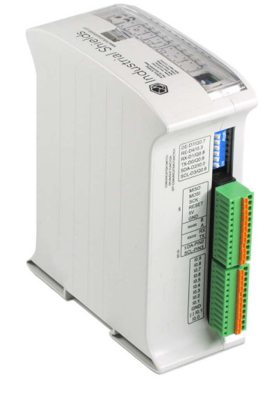
SS*: Software Serial